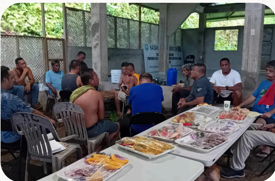
OPEN DISCUSSIONS & QUESTIONS BETWEEN COMMUNITY MEMBERS AND STAKEHOLDERS.